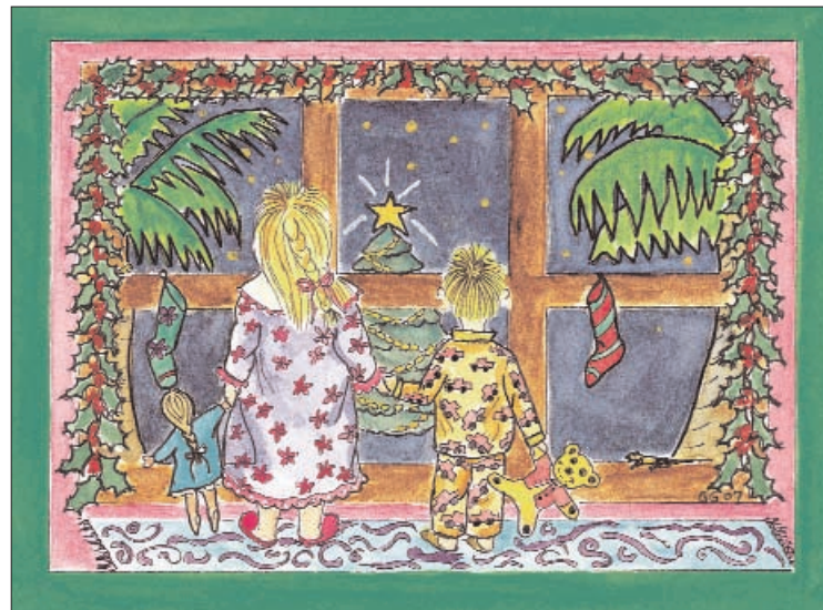
“Waiting for Santa” Gretchen Gurr