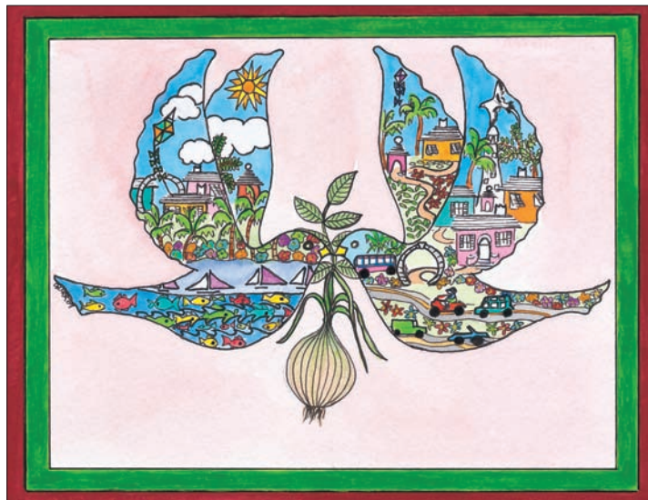
“Doves of Peace” Gretchen Gurr